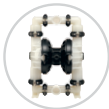
AOD 50 PVDF Clamped

CLAMPED model available for specific applications