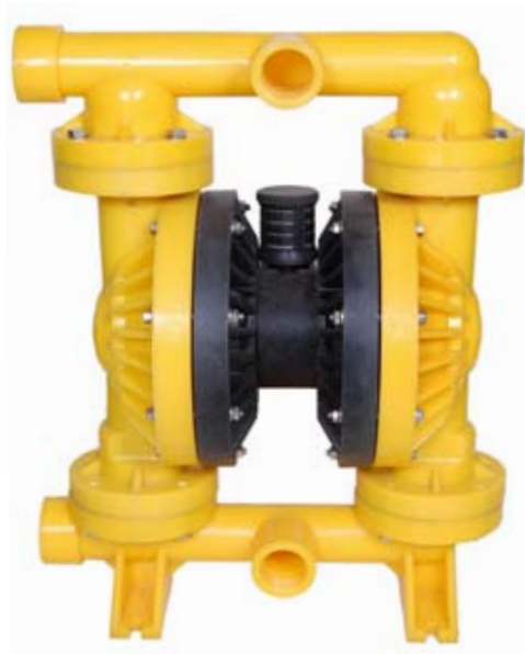
AOD 500 PP Bolted