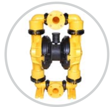
AOD 50 PP Clamped

CLAMPED model available for specific applications