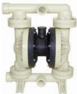
AOD 500 PVDF Bolted