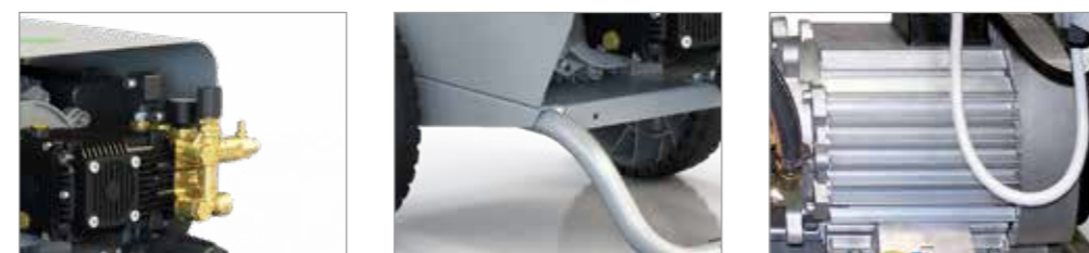
IPC PLUNGER PUMP WITH BRASS HEAD AND CERAMIC PISTONS