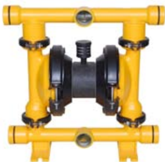
AOD 40 CI Clamped