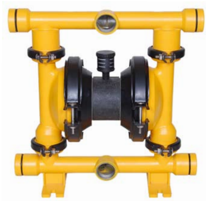
AOD 40 AL Clamped

Max Particle Size (Dia): 4.76mm (0.188")