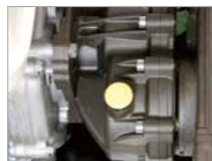
PROVIDED WITH A REDUCTION GEAR IN ORDER TO EXTEND PUMP LIFESPAN