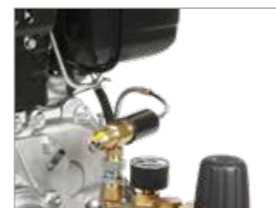
EQUIPPED WITH ENGINE THROTTLE CONTROL IT REDUCES ENGINE RPM WHEN BY-PASS IS ACTIVATED