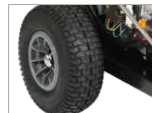
LARGE DIAMETER, WIDE TREAD TYRED WHEELS SUITABLE FOR ANY SURFACE