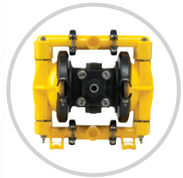
AOD 15 PP Clamped

CLAMPED model available for specific applications