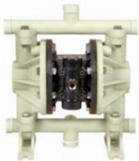
AOD 150 PVDF Bolted