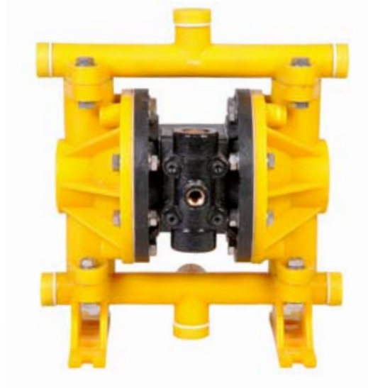
AOD 150 PP Bolted