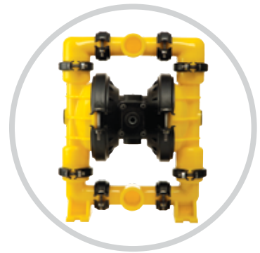
AOD 40 PP Clamped

CLAMPED model available for specific applications