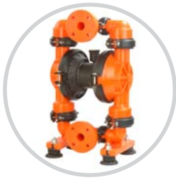
AOD 25 PP Clamped

CLAMPED model available for specific applications