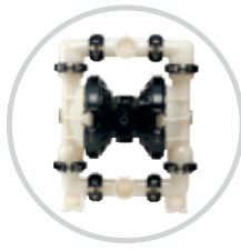
AOD 40 PVDF Clamped

CLAMPED model available for specific applications