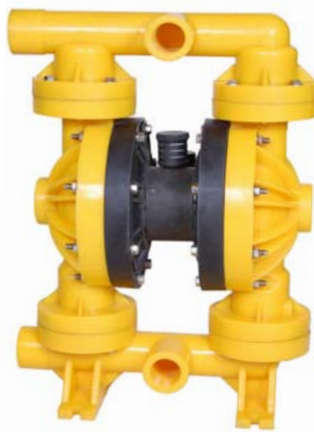
AOD 400 PP Bolted

CLAMPED model available for specific applications