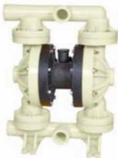
AOD 400 PVDF Bolted