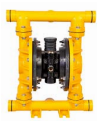
AOD 300 CI Bolted