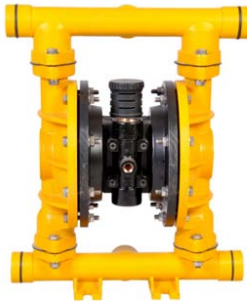
AOD 300 AL Bolted