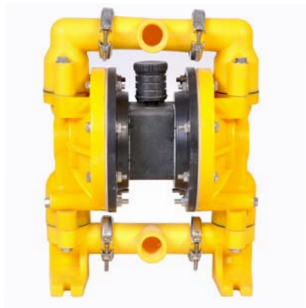
AOD 300 PP Bolted